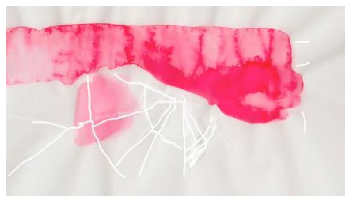
Mirrors (United Kingdom) directed by Emilia Izquierdo