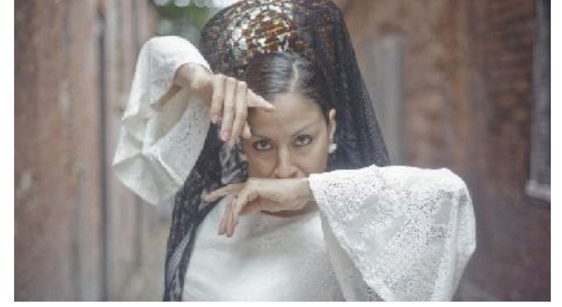
Saeta: The Mourning (United Kingdom) directed by Rosamaria E. Kostic Cisneros